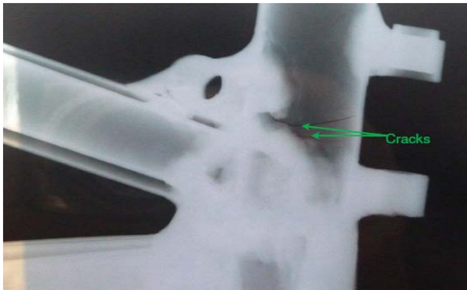
Figure 2 – Detail view of tail joint damage area